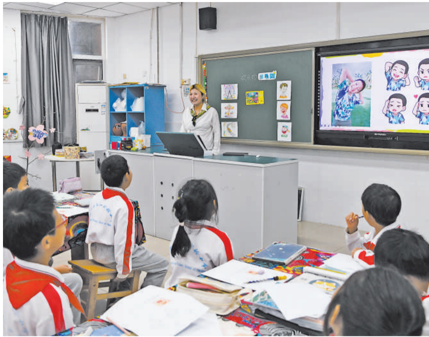
A teacher shows cartoon images of students generated by AI technology.

supply and the level of modernization will be substantially elevated.