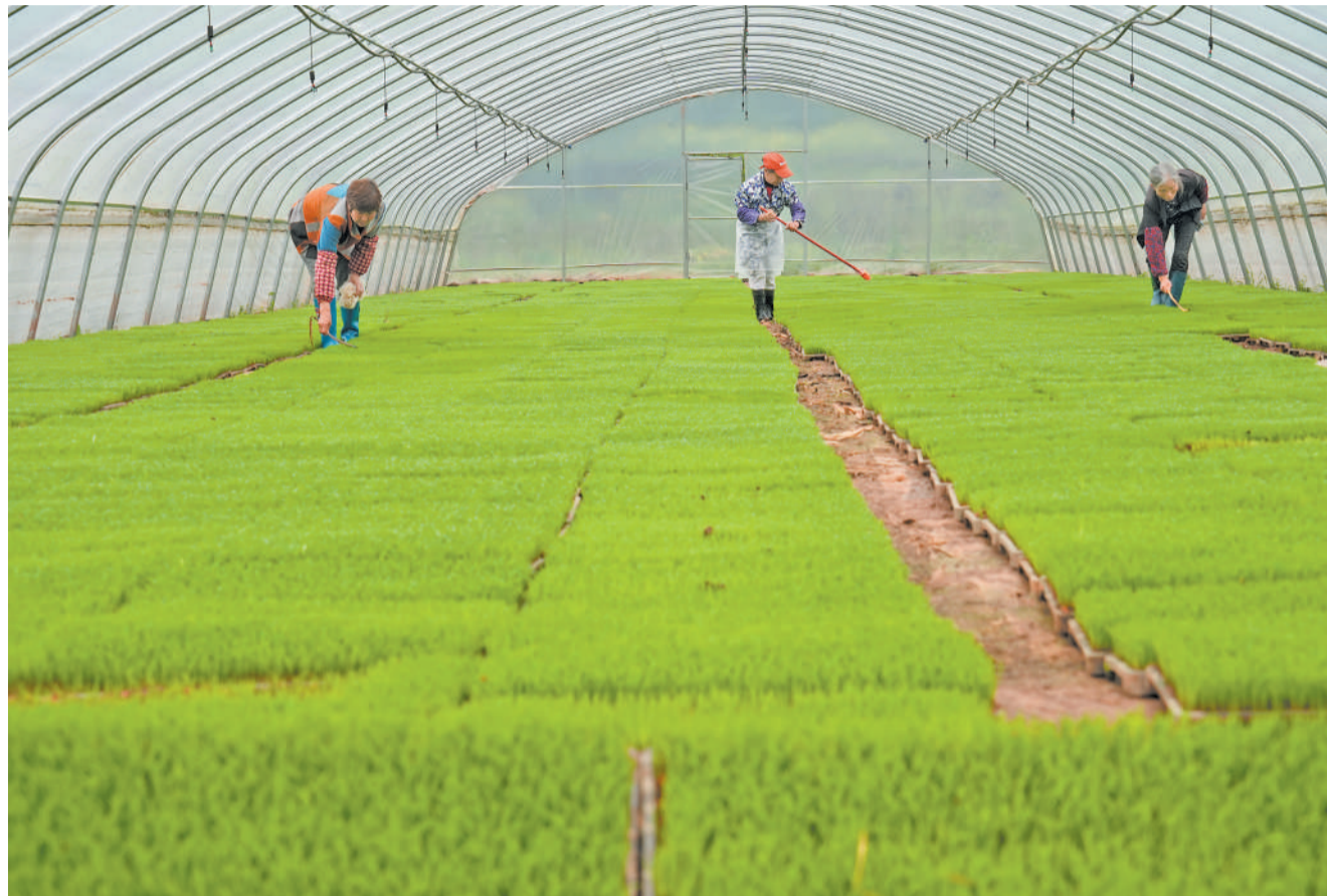
Farmers tend to early rice seedlings at a greenhouse in Qidong county, Hengyang city, Hunan province, March 30.