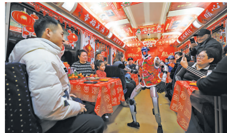
On February 13, 2026, a bionic robot performs a dance in the carriage of Train T48.

"Cooperation" involves leveraging the comparative strengths of APEC economies, enhancing policy synergy and experience exchanges to achieve mutual benefit.