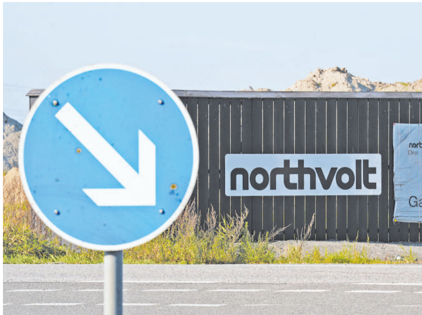
The road to Northvolt's stalled battery plant in Heide, Schleswig-Holstein, Germany, October 2025.

Even a basic application of common sense shows how implausible it is to attribute Northvolt's failure to Chinese equip-