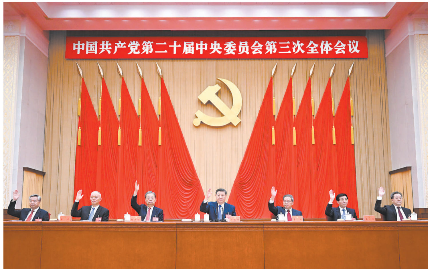
Xi Jinping, Li Qiang, Zhao Leji, Wang Huning, Cai Qi, Ding Xuexiang and Li Xi attend the third plenary session of the 20th Communist Party of China (CPC) Central Committee in Beijing, capital of China. The plenary session was held from July 15 to 18, 2024.

The 20th Central Committee of the Communist Party of China (CPC) adopted a resolution on further deepening reform comprehensively to advance Chinese modernization at its third plenary session held here from Monday to Thursday.