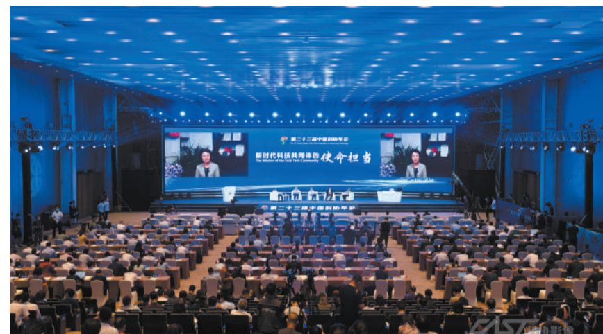
The opening ceremony of the 23rd Annual Meeting of CAST

According to Wan, China seeks to actively conduct the work on impact assessment and rules design for sci-tech risks, and continue to work with the international sci-tech community to jointly tackle major challenges to benefit the development of humanity.